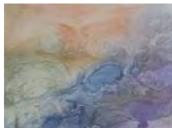
WATERCOLOUR 3rd Belinda Ingram