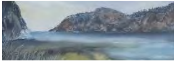
OVERAL SECOND Maxine Sumner