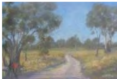
PASTEL 2nd Eileen Slattery