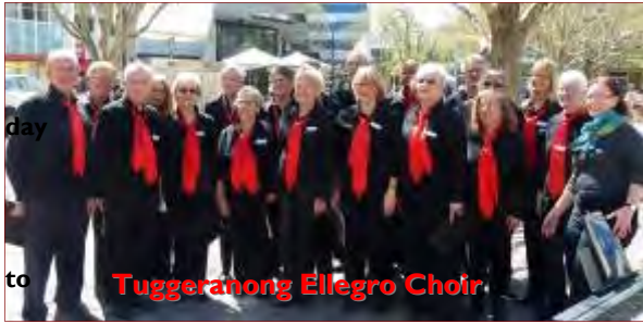
Tuggeranong Ellegro Choir

D O you know of any district choirs that would be interested in singing at the QAS Charity Art Show in City Walk, Canberra on Saturday 19th to Sun-27th September 2015?