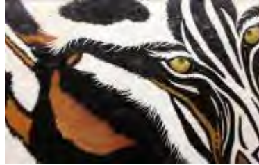
ACRYLIC 3rd Gail Gray