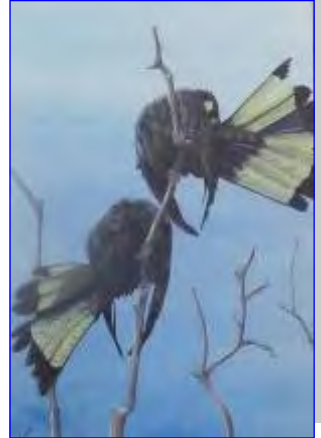
ANY OTHER MEDIA 1st Vivien Pinder