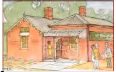
QAS GALLERY on the bank of the Queanbeyan River.

Members please keep an 'eye' on the Calendar of Events as it may be updated.