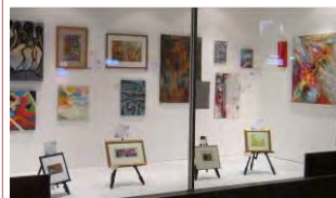
Queanbeyan Riverside Plaza

T HE Society is fortunate to have four venues to display and sell members' art. Above is one of our successful venues and of course we have the QAS Gallery, Government House (Canberra) and City Walk (Canberra). It has been a record year for the Society in art sales.