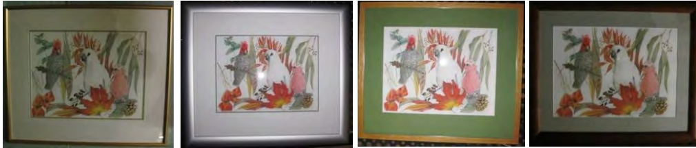
Gold frame 50% of vote cost $218.

many artists do struggle when it comes to selecting the correct frame.